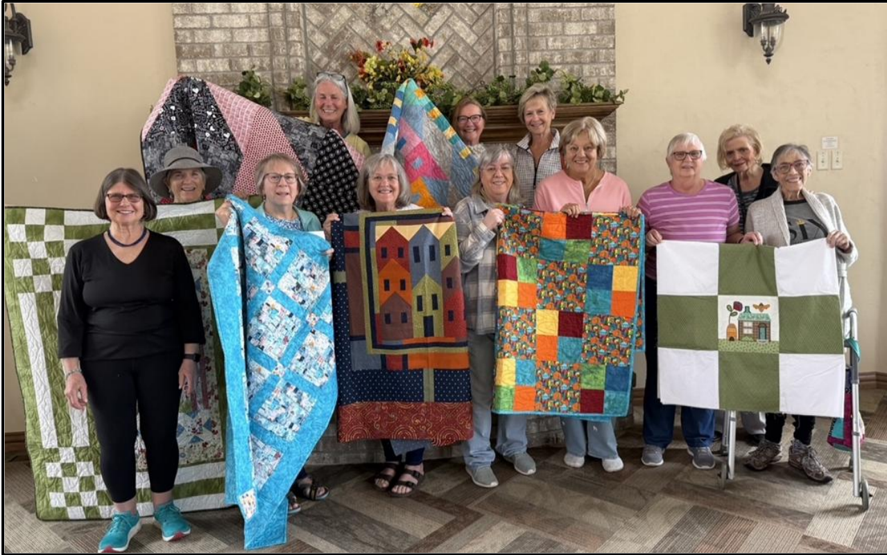
Happy faces make happy quilts!!

It's an easy and fun project for anyone who enjoys making quilts. Our next meeting is October 5, 2026 . (Details in upcoming newsletters) For more information, contact: