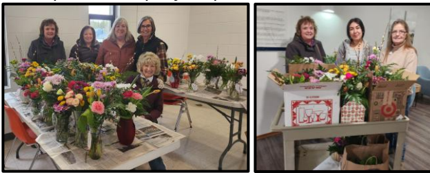
BCCWC volunteers gathered to assemble "Smile Bouquets".

more times this summer to make more bouquets for other nursing homes. Please join us next time. Contact one of the chairs to be put on our volunteer list.