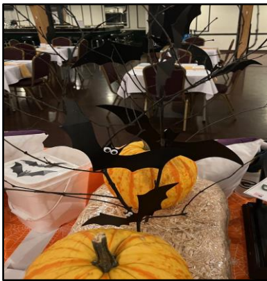
"Spooktacular" highlights from the Card and Game Day fundraiser at Riverside.