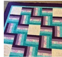
Another beautiful quilt - see the display at the September 17 fall luncheon at the Swan Club.