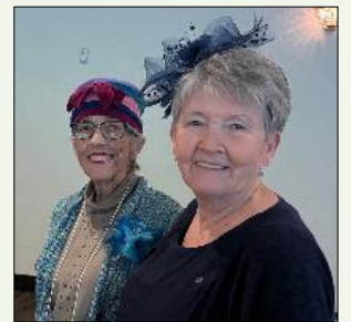
Ladies showed up in a variety of party outfits, hats and fascinators.