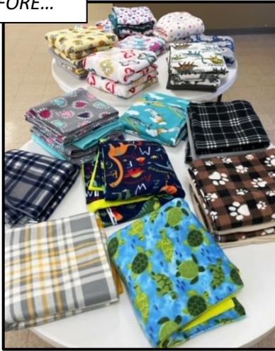
Beautiful pieces of fleece.