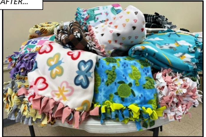
Cozy blankets full of comfort to be treasured by the hospitalized children at St. Vincent Children's Hospital.

Twenty-five blankets were tied and delivered to St. Vincent Children's Hospital – Child Life Department in February. Many BCCWC members took part in the fun and fellowship of this project. A sincere "Thank You" to all who contributed in some way to make this project happen! The blankets bring great comfort to the children, and parents, too, at a challenging and often scary time.