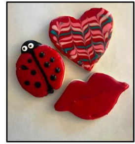
A few of the finished designs