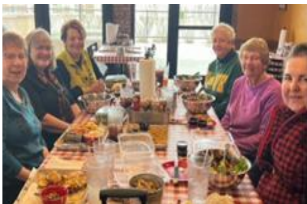
Lunch Bunch at Parker John's – January 2024