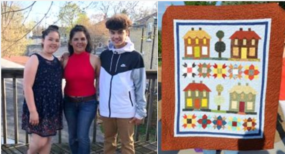
This family received their new home and beautiful lap-size quilt a few years ago. An easy and fun project for anyone that enjoys sewing.