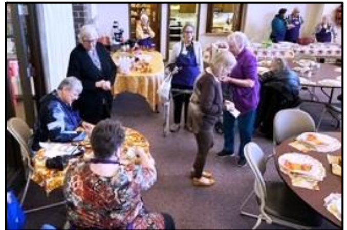
BCCWC members preparing for the Fort Howard luncheon.