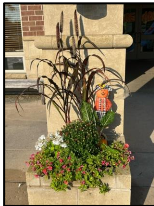
Fall beautification outside the Kress Library in De Pere.