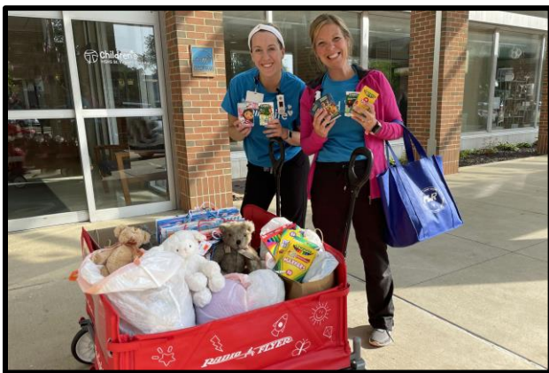
The Child Life staff graciously accepts the generous BCCWC donations collected at the fall luncheon.

Thank you! Thank you! Grateful for the generous outpouring at the September luncheon for the 'Child Life Collection' of baby rattles, Crayola markers, stuffed animals, and band aids. The Child Life staff were so appreciative, and very thankful to have their needs replenished. As they said, "We can always depend on the ladies of BCCWC!" Many thanks to everyone who signed up to help assemble the 'Halloween bags' in October. The sign-up sheet is full for assembling Halloween bags, but please stop at the 'Child Life' table at the October meeting if you're interested in signing up to decorate the little Christmas trees in December.