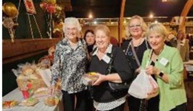
Yum Yum Yum Yum