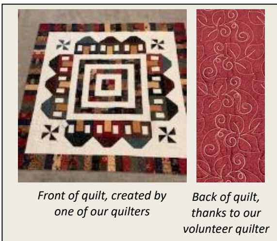
Front of quilt, created by one of our quilters

Our wonderful volunteer machine quilter was also at the meeting. She makes everything come together: