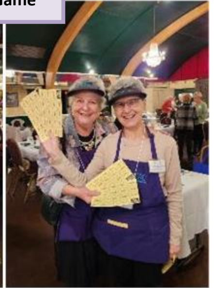
Raffle Ticket Hawkers