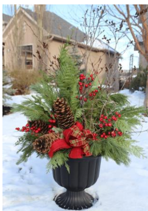
Welcome in the holiday season with a festive planter