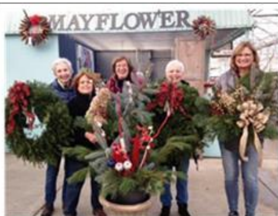
Creations made by BCCWC members at a similar event a few years ago