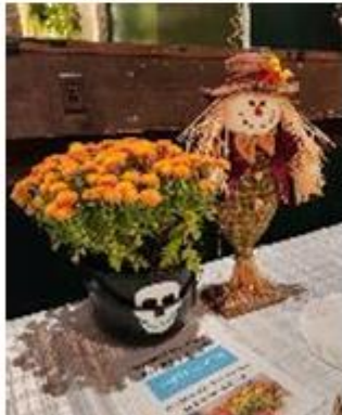
Table Décor by Mayflower Greenhouse