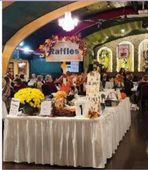
Fabulous Raffle Table