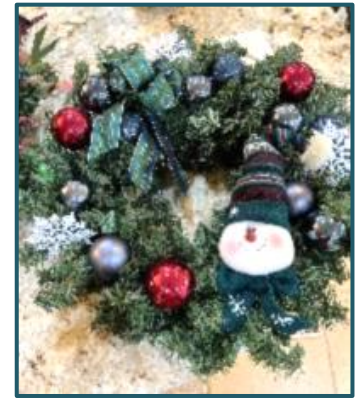
"Sneak preview" of one of the BCCWC wreaths

Wreaths are designed and donated by many local organizations and businesses. Look for the 12 created and designed by BCCWC members, including "Frosty and Friend", "Sno Cute" and "Winterland Wonder". Be sure to check them out when you're doing your holiday sightseeing downtown.