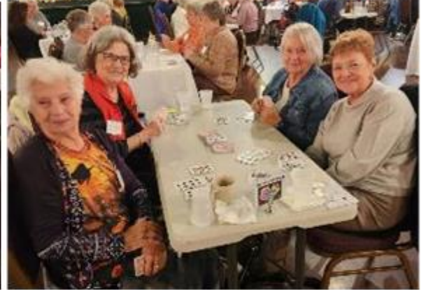
Guests included Hand & Foot Players