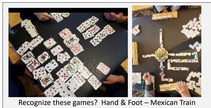
Recognize these games? Hand & Foot – Mexican Train

As always, there were beautiful raffle prizes, unusual silent auction items, a money tree and, of course, a 50/50 raffle. Thanks to all who came to make this day a big fundraising success. Can't wait to see you all at the spring Card & Game Day. Mark your calendars now for April 26. Watch future newsletters for the registration form when it becomes available.