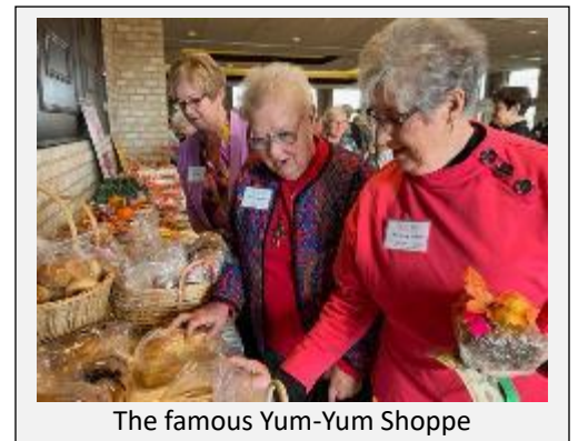
The famous Yum-Yum Shoppe

More than 200 members and non-members enjoyed a fabulous afternoon at Thornberry Creek for the fall Card & Game Day. Despite a brisk wind, the day was bright and sunny and the atmosphere inside was festive and colorful. A wonderful lunch was followed by a variety of games - bridge, hand and foot, dominoes, 5 Crowns, Mah Jongg and others. Colorful insulated bags were given out to 25 door prize winners and specially embroidered towels were door prizes for a lucky few.