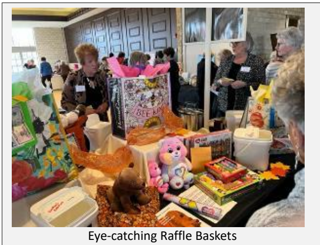
Eye-catching Raffle Baskets