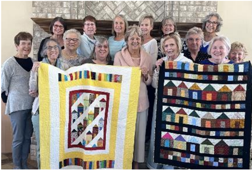
The quilters at their October meeting - what a wonderful, creative and productive group!

Eight quilts are waiting at the Habitat for Humanity office for upcoming dedications. Forty-three quilts have been given to Habitat families since February 2016.