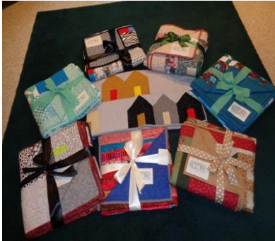
BCCWC quilters are engaged in a labor of love for Habitat for Humanity families and our community.

Six families appreciated the quilts given to each of them at the June 8 Habitat for Humanity dedications. Thirteen lap-sized quilts presented to Habitat for Humanity families since February, 2016 represent approximately 800 volunteer hours. Each quilter pays for her own materials averaging $50 a quilt. Our anonymous long-arm quilter, who charges nothing, machine quilts each quilt. That donation is worth approximately $100/quilt.