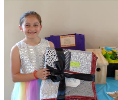
One of the happy recipients of a quilt - June 8, 2017.