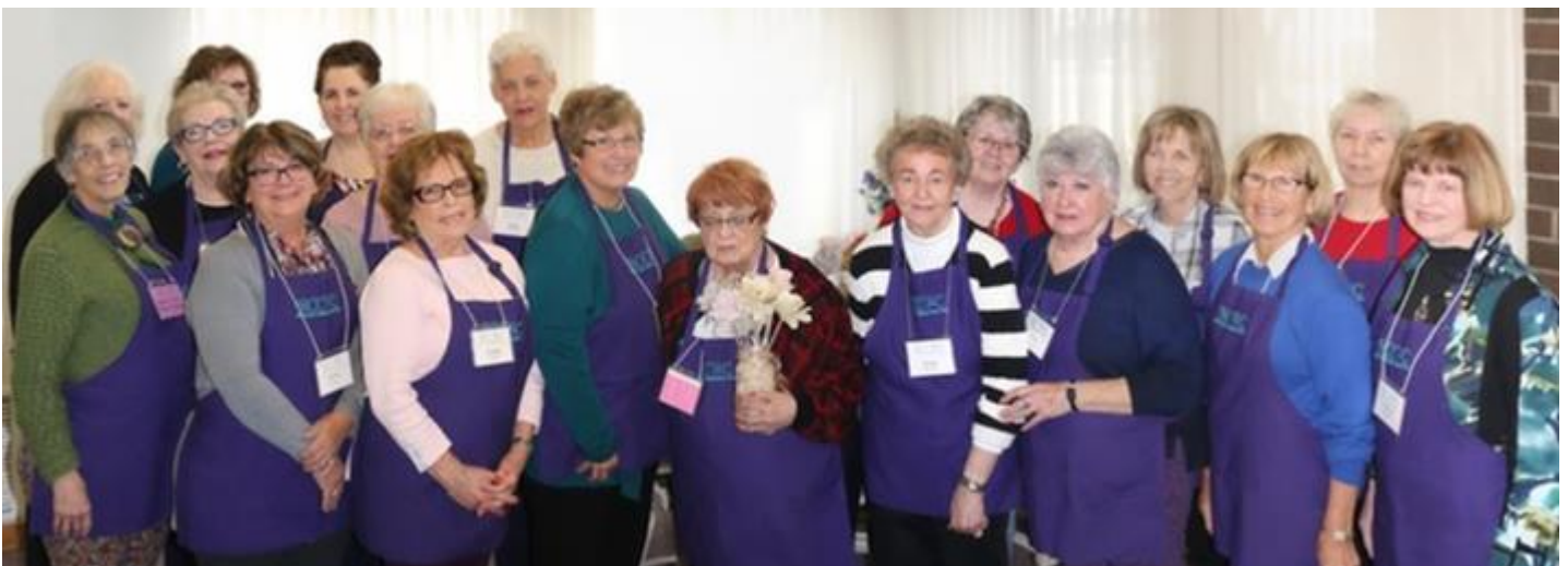
Volunteers for annual spring luncheon buffet and bingo

On Thursday, March 23, 46 eager residents, three staff and one Fort Howard volunteer were treated to a delicious and plentiful buffet prepared and served by 23 BCCWC volunteers. Everyone enjoyed the delicious casseroles, salads, rolls and desserts served by our group. The most requested recipe was for the chicken stuffing casserole. The casseroles were kept warm by the new oven which was purchased with partial funding from a BCCWC Community Award Grant. The room was lively with warm, smiling and cheerful faces at tables decorated with handmade paper bouquet centerpieces. Residents chatted among themselves and with our members. Following the buffet, many residents played bingo and were thrilled by the prizes donated by BCCWC members. All present left with a full tummy, a smile and a promise to "see you in the fall!"